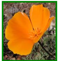
CA Poppy, 1"