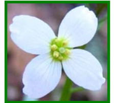
Milk Maid, 1/2"