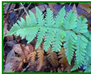
Coastal Wood Fern