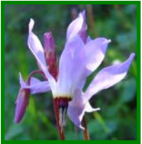
Shooting Star, 1"