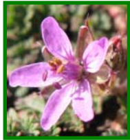
Red-Stem Filaree, 1/4"