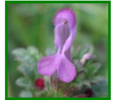
Clasping Henbit, 1/4"