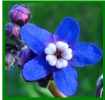
Hound's Tongue, 3/4"