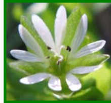
Common Chickweed, 1/2"