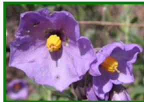
Blue Witch, 1"