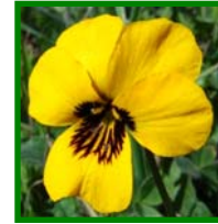
Johnny Jump Up, 1"