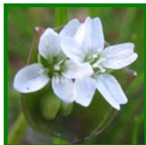
Miner's Lettuce, 1/4"