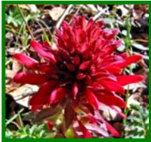
Indian Warrior, 3"