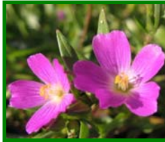
Red Maid, 1/2"