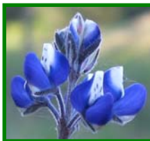
Miniature Lupine, 1/2"