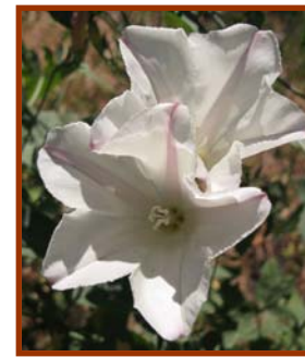
Climbing Morning Glory