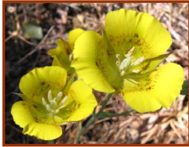
Yellow Mariposa Lilies