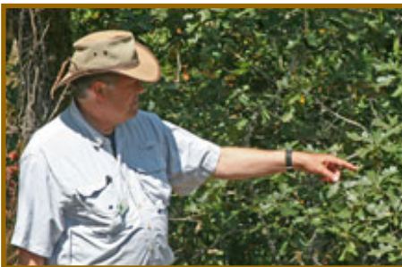
Black Oak Leaf Characteristics