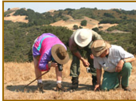
Admiring a Tiny Wild Flower