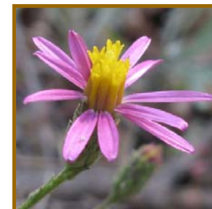
Common California Aster