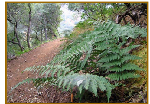
Coastal Wood Fern